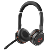
JABRA EVOLVE 75

Designed specifically for Dell, the Timbuk2-Authority backpack is built to carry and protect everything you need for the workday. The internal organizer provides ample space for laptop accessories and any extra items you need to carry.