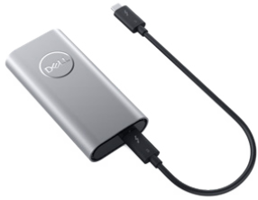
DELL PORTABLE THUNDERBOLT 3 SSD, 1TB

One of the world's fastest portable SSD storage devices, the Dell Portable Thunderbolt™ 3 SSD 512GB & 1TB versions let you backup or transfer all your large files at lightning fast speeds of 2800 MB/s.