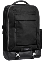
TIMBUK2 - AUTHORITY FOR DELL - 15"

One of the world's fastest portable SSD storage devices, the Dell Portable Thunderbolt™ 3 SSD 512GB & 1TB versions let you backup or transfer all your large files at lightning fast speeds of 2800 MB/s.