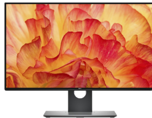
DELL 27 ULTRASHARP MONITOR WITH PREMIER COLOR | UP2718Q

Dell's most powerful dock* for our most powerful workstations* delivers the ultimate productivity experience. Charge your system faster, support up to three 4K displays and connect to your peripherals via a single cable with dual USB-C connectors for up to 240W of power delivery.