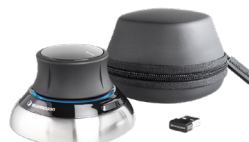
3DCONNEXION SPACEMOUSE WIRELESS

Bring your ideas to life with the groundbreaking new workspace tool that uses an intuitive touch screen, pen and totem to enable natural digital creation.