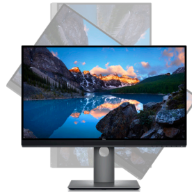
DELL ULTRASHARP 4K USB-C MONITOR WITH PREMIER COLOR | UP2720Q

Dell's most powerful dock* for our most powerful workstations* delivers the ultimate productivity experience. Charge your system faster, support up to three 4K displays and connect to your peripherals via a single cable with dual USB-C connectors for up to 240W of power delivery.