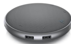
Dell Mobile Adapter Speakerphone | MH3021P