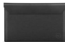
Dell Premier Sleeve - XPS 17